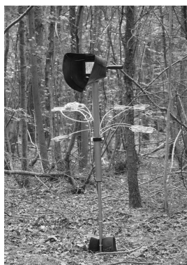
Figure 2. The Periscope

The probe tool was designed to enable student-initiated collection of real time measurements of light and moisture. It is very simple to operate; place it anywhere in the environment, select 'light' or 'moisture' and then press the 'read' button (Figure 1). Whilst it is possible to record these variables using existing instruments our device provided feedback as relative dynamic visualizations, intended to provoke the children to hypothesize what they meant rather than write them down as precise numerical readings. In addition, the probe tool was designed to transmit and store all the readings and the location at which they were collected in the woodland (using GPS) for further reflection at a later stage.