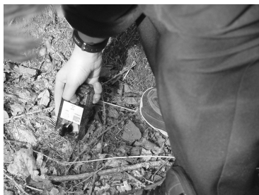
Figure 1. Using the probe to take a moisture reading

The PDA was used to present environmentally triggered images of plants and animals to the students at pertinent times to draw their attention to particular aspects of the physical environment.